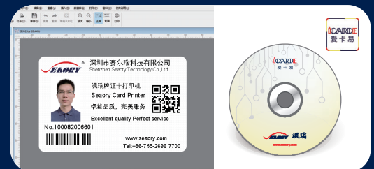
Come with professional printing software