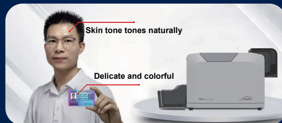
High quality photo processing by Dye sublimation technology

Dual interface card encoding module Contactless ID Card encoding module UHF chip card encoding module Magnetic stripe card encoding module